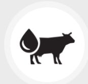
Animal fat cat 1 & 2