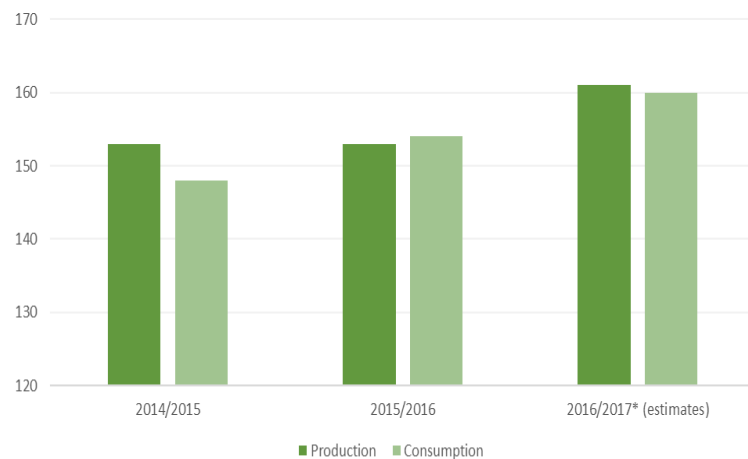
Global vegoil production and consumption (Aggregate of palm oil, soybean oil, rapeseed oil, and sunflowerseed oil - in million tonnes)

In Brazil, soybean seeding is now progressing rapidly. 28% of the area has been seeded against 20% at the same period last year.