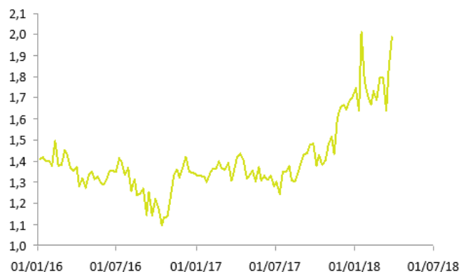
UCOME incentive over FAME 0°C

TME producers expect that the demand will pick up in Italy for the second half of the year with the cancellation of FFA and PFAD as DC feedstock.