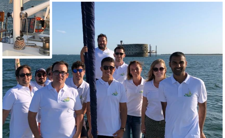
GREENEA TEAM BUILDING 2019 :)