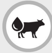
Animal fat cat 1 & 2