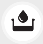
Used Cooking Oil

Every month, GREENEA provides our clients and partners with reliable and up-to-date information about feedstock and biodiesel markets. All the information in our monthly Market Watch is based on the latest traded prices.