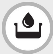
Used Cooking Oil

Every month, GREENEA provides our clients and partners with reliable and up-to-date information about feedstock and biodiesel markets. All the information in our monthly Market Watch is based on the latest traded prices.